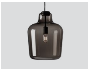
Say My Name pendant smoked grey glossy – Item no. 660