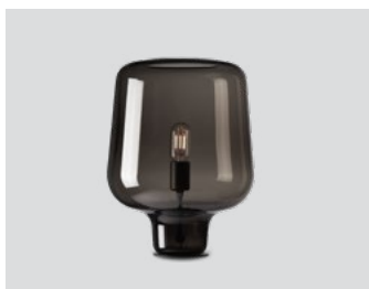
Say My Name table smoked grey glossy – Item no. 662