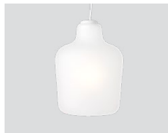
Say My Name pendant white matt – Item no. 668