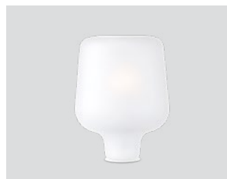
Say My Name table white matt – Item no. 669