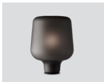
Say My Name table smoked grey matt – Item no. 663