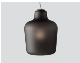
Say My Name pendant smoked grey matt – Item no. 661