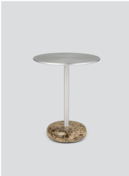
Ton side table D40H50

NOK 6 990,- / SEK 7 690,- DKK 5 390,- / EURO 729,-