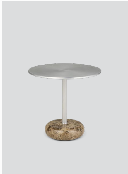
Ton side table D48H42

Colours: Brushed aluminium and mixed brown marble