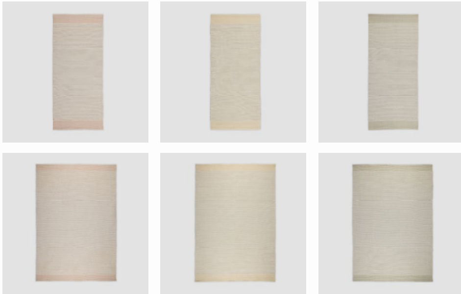
Spool runner 80×200cm

Photo by Sara Spilling Styling by Per Olav Sølvberg