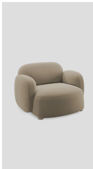
Gem lounge chair with armrest

Prices from: NOK 14 990,- / SEK 16 490,- DKK 12 990,- / EURO 1 499,-