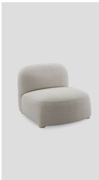
Gem lounge chair