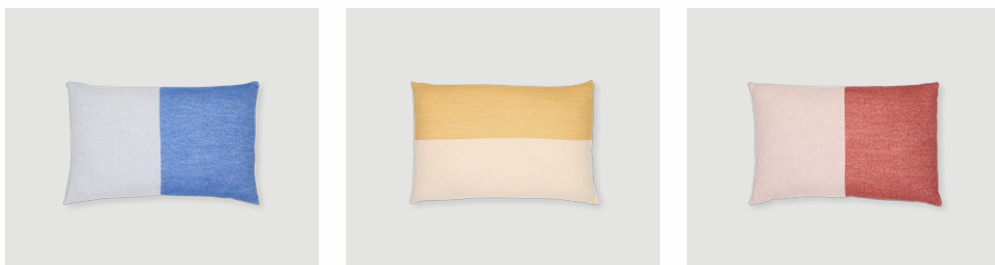
Echo throw blanket

Prices: NOK 1 490,- / SEK 1 590,- DKK 1 090,- / EURO 149,-