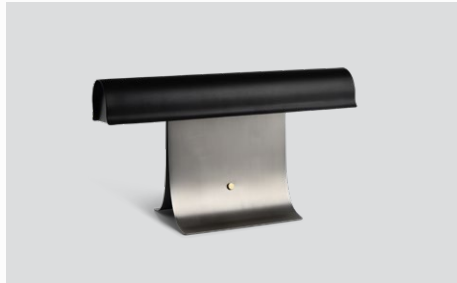
Archive L25 table lamp

NOK 3 490,- / SEK 3 790,- DKK 2 690,- / EURO 349,-