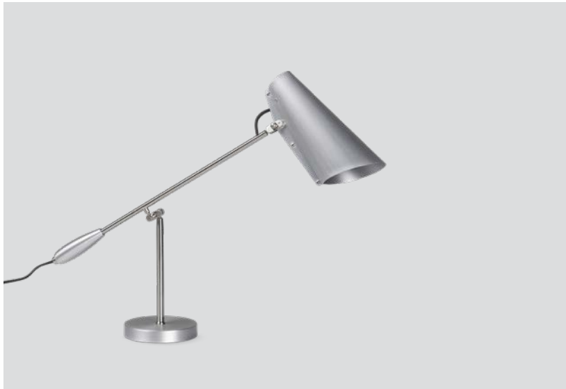
Birdy table lamp 70th Anniversary Edition Aluminium / Steel

NOK 3 690,- / SEK 3 990,- DKK 2 990,- / EURO 399,-