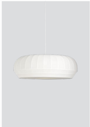
Tradition large oval pendant Off-white

NOK 5 490,- / SEK 5 990,- DKK 4.490,- / EURO 599,-