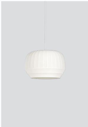
Tradition small pendant Off-white

NOK 5 490,- / SEK 5 990,- DKK 4.490,- / EURO 599,-