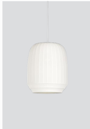
Tradition tall pendant Off-white

NOK 3 990,- / SEK 4 390,- DKK 3 290,- / EURO 429,-