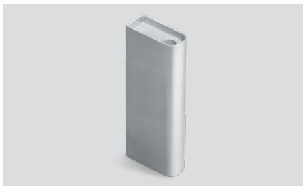
Monolith tall NOK 1 590,- / SEK 1 690,- DKK 1 290,- / EURO 169,-