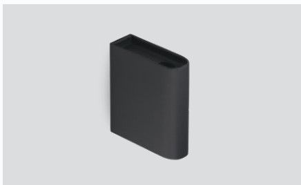
Monolith wall NOK 1 390,- / SEK 1 490,- DKK 1 090,- / EURO 149,-

Colours: Mixed white marble, mixed green marble, brushed aluminium or black