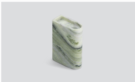
Monolith medium NOK 1 290,- / SEK 1 390,- DKK 990,- / EURO 139,-