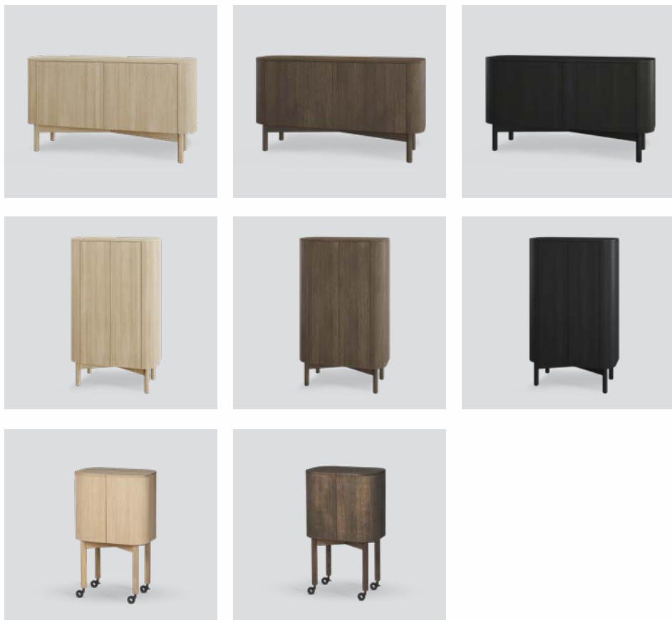
Loud sideboard / tall cabinet light oak / smoked oak / black

NOK 44 990,- / SEK 48 990,- DKK 36 990,- / EURO 4 899,-