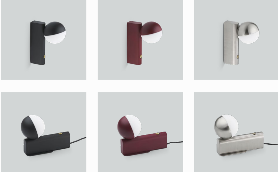
Balancer mini wall / table Black / cherry red / steel

NOK 2 290,- / SEK 3 290,- DKK 2 390,- / EURO 319,-