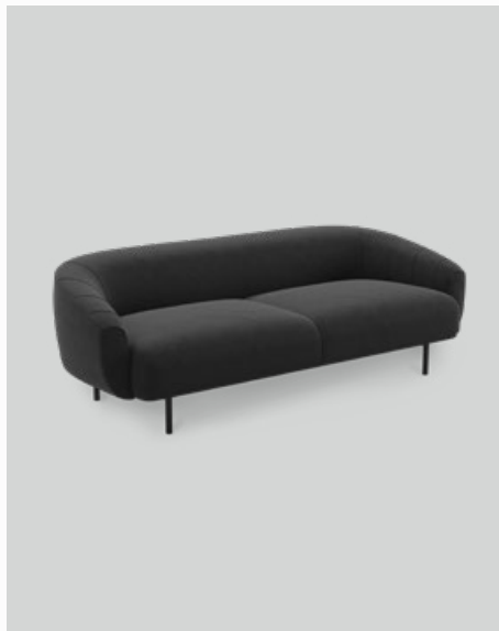
Plis 3 seater sofa

NOK 29.990,- / SEK 32.990,- DKK 24.990,- / EURO 3.299,-