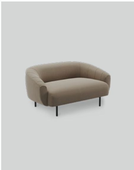
Plis 2 seater sofa

Styling by Per Olav Sølvsberg