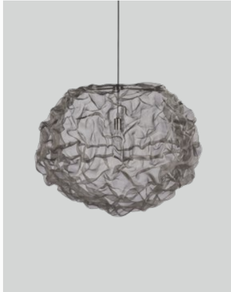
Heat XL pendant lamp brass / steel