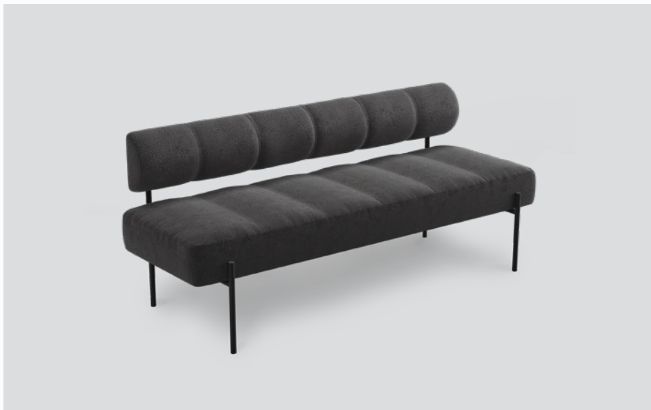
Daybe dining sofa