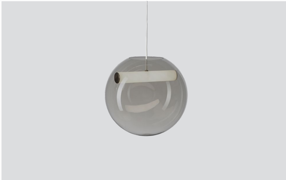
Reveal pendant large

NOK 8.990,- / SEK 9.990,- DKK 7.290,- / EURO 999,-