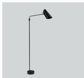
Birdy table swing

NOK 3.690,- / SEK 3.990,- DKK 2.990,- / EURO 399,-