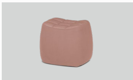
Yam small pouf

NOK 12.400,- / SEK 13.190,- DKK 9.700,- / EURO 1.290,-