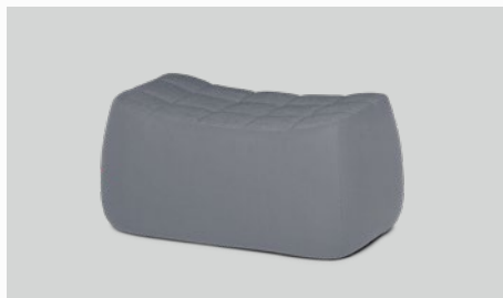
Yam medium pouf

Retailers and distribution: See details at northern.no