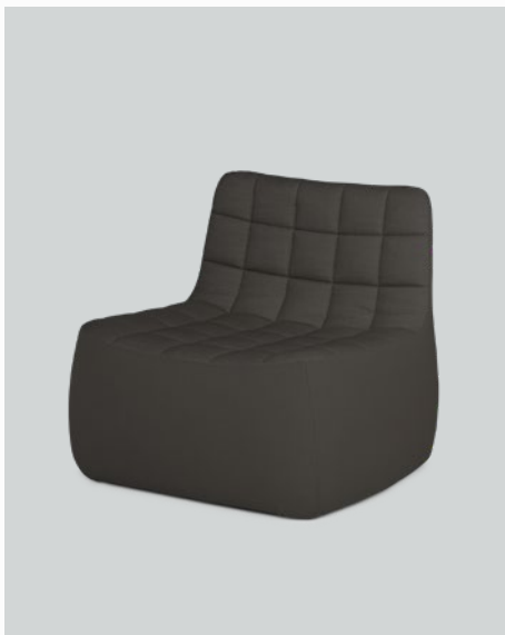
Yam lounge chair

NOK 19.900,- / SEK 20.900,- DKK 15.900,- / EURO 2.150,-