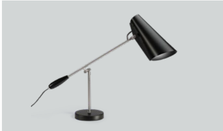
Birdy table black / steel

NOK 2.990,- / SEK 3.190,- DKK 2.290,- / EURO 319,-