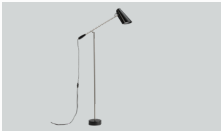
Birdy floor black / steel

NOK 2.990,- / SEK 3.190,- DKK 2.290,- / EURO 319,-