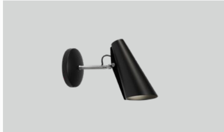
Birdy wall short arm black / steel

NOK 3.990,- / SEK 4.290,- DKK 2.990,- / EURO 429,-