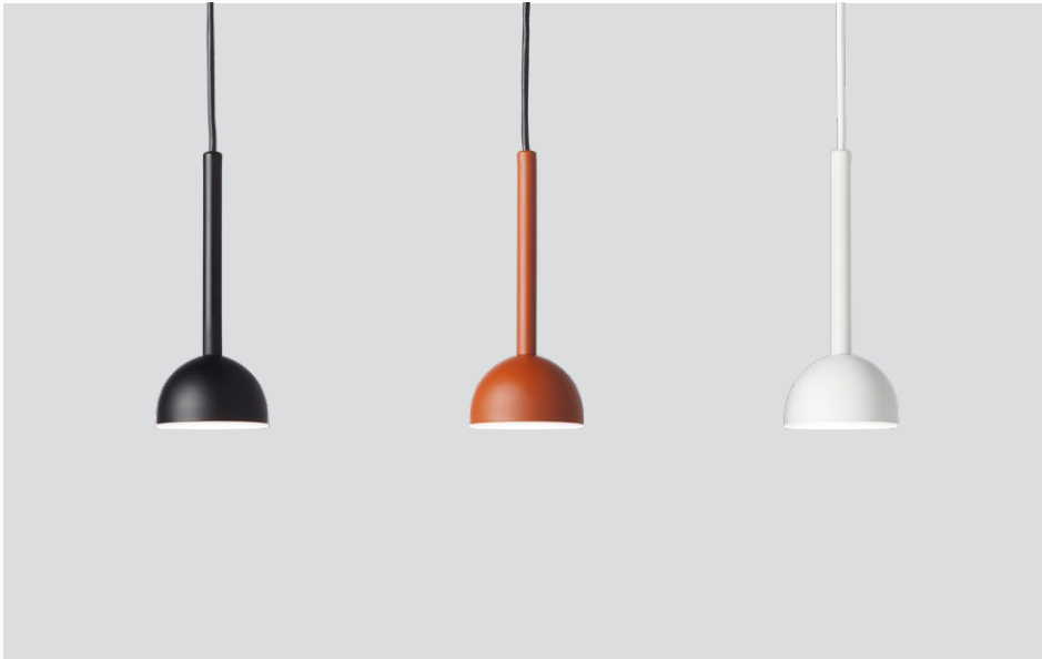
Blush pendant black / rust / white

EURO 199,- / SEK 1.990,- DKK 1.490,- / NOK 1.890,- GBP 189,-