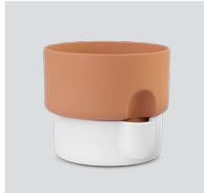
Oasis small green / dark brown / white

EURO 65,- / SEK 590,- DKK 450,- / NOK 590,- GBP 55,-