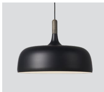
Acorn white – Item no. 540