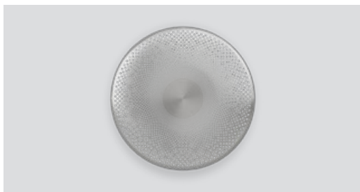
Glint wall aluminium – Item no. 267