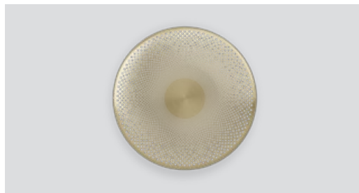
Glint wall brass – Item no. 266