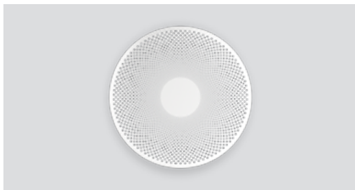
Glint wall white – Item no. 265