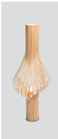
Diva floor oak – Item no. 370