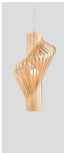
Diva pendant oak – Item no. 380