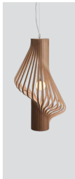
Diva pendant smoked oak – Item no. 382