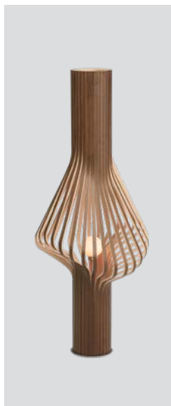
Diva floor smoked oak – Item no. 372