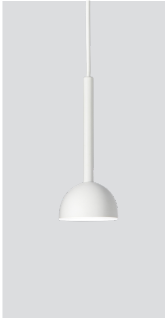
Blush white – Item no. 117