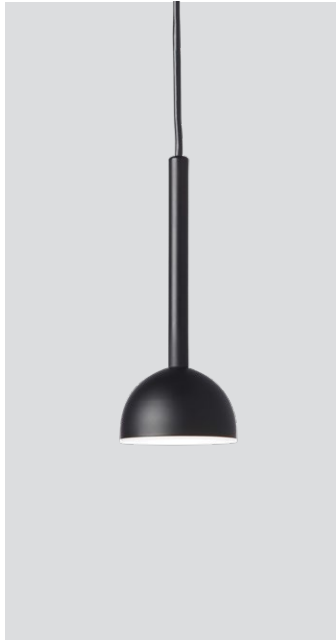
Blush black – Item no. 116